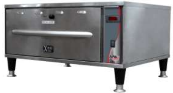
Model: HDXi-1 Countertop Holding Drawer