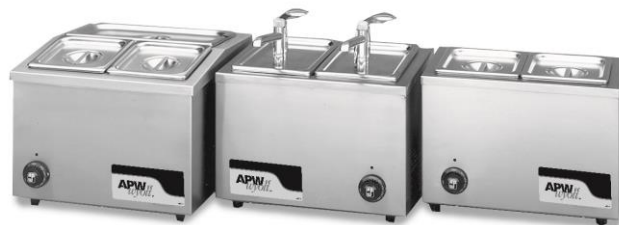
Pumps & lids by others