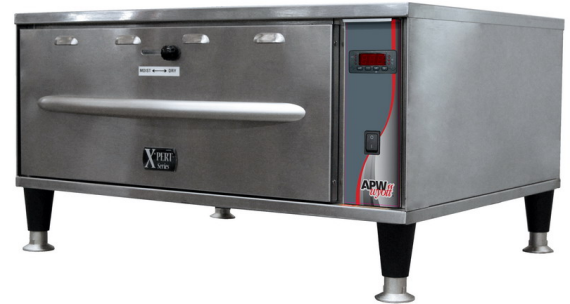
Model: HDXi-1 Countertop Holding Drawer