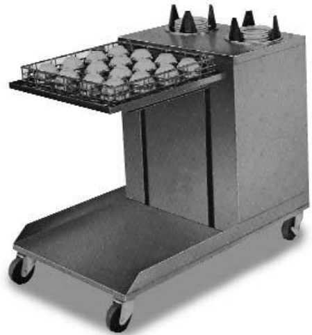
Model: Mobile Cup and Saucer Lowerator®