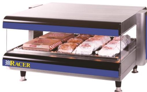
Model: Racer® Horizontal Open Air Heated Merchandisers