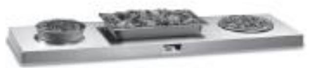
Model WS-5 Warming Shelf