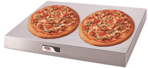
Model WS-3 Warming Shelf